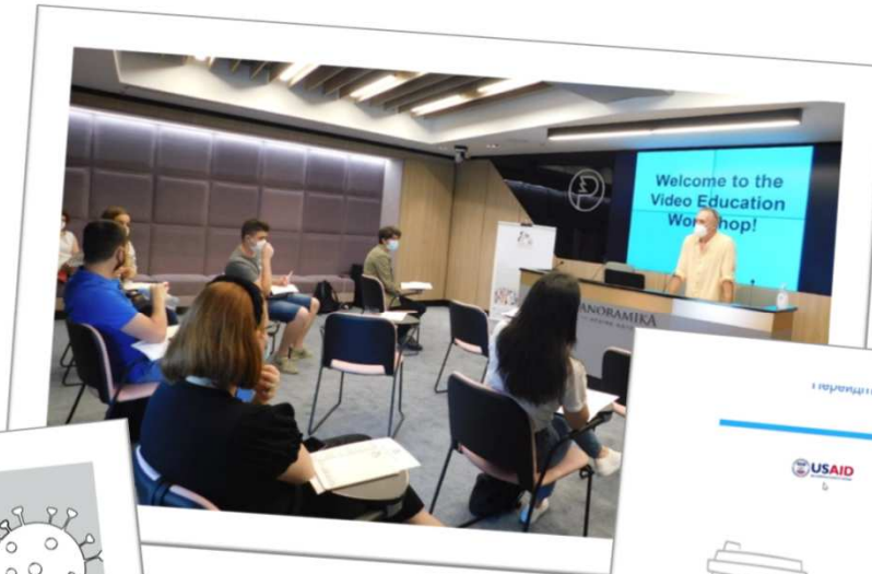
IFES North Macedonia, Youth Public Policy Academy