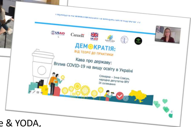
IFES Ukraine & YODA, Coffee with the State