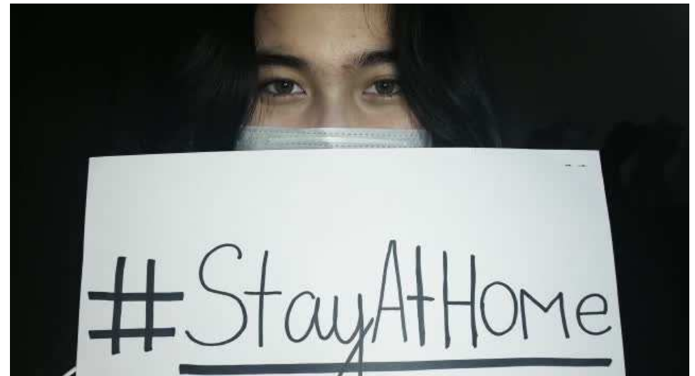
IFES Kyrgyzstan Democracy Camp participant post on Instagram