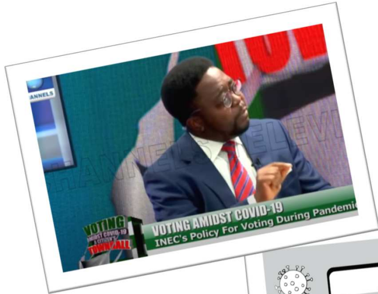
IFES Nigeria & Yiaga Africa, Public debate on elections policy